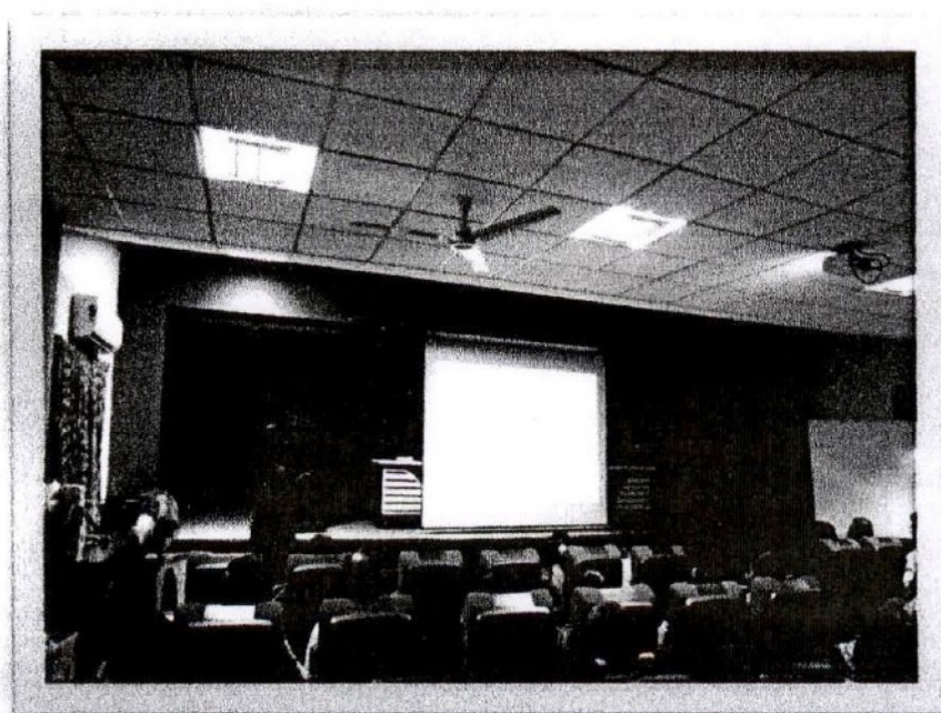
Awareness Programme on Ethics and Values on 19-8-2019