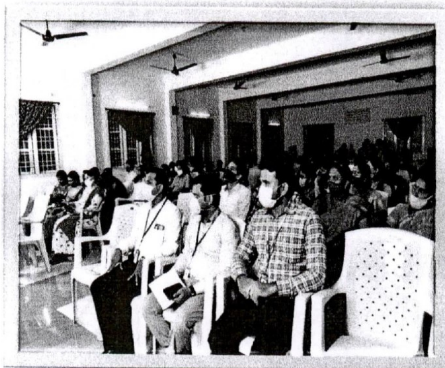
Faculty attended for the programme on Ethics and Values on 27-07-2019